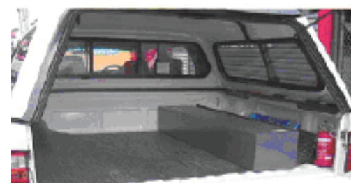
Ammunition must be stored in a separate locked container (i.e. locked in glovebox or locked box in the cab, not with the firearms).