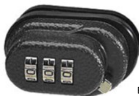
Examples of trigger locks

Doors must be locked while the vehicle is unattended and keys must not be left in the vehicle.