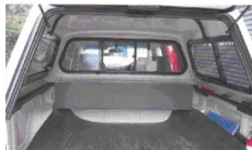
Safe bolted to structural parts of the vehicle.

The firearm must be rendered temporarily incapable of being fired (e.g. by removal of the bolt/firing mechanism or the use of trigger locks) or must be kept in a locked container that is properly secured to, or is within the vehicle.