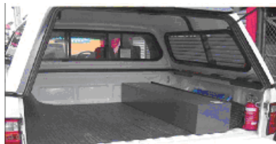
Ammunition must be stored in a separate locked container ie locked in the glovebox or locked box in the cab, not with the firearms