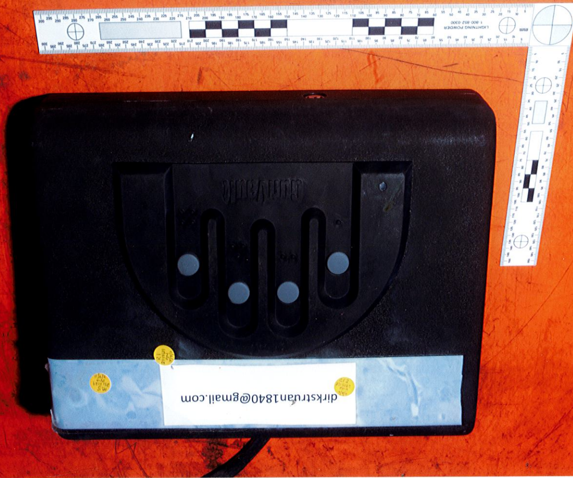
PHOTOGRAPH 12. VIEW OF BOTTOM OF DEVICE SHOWING CODED TOUCH PADS.