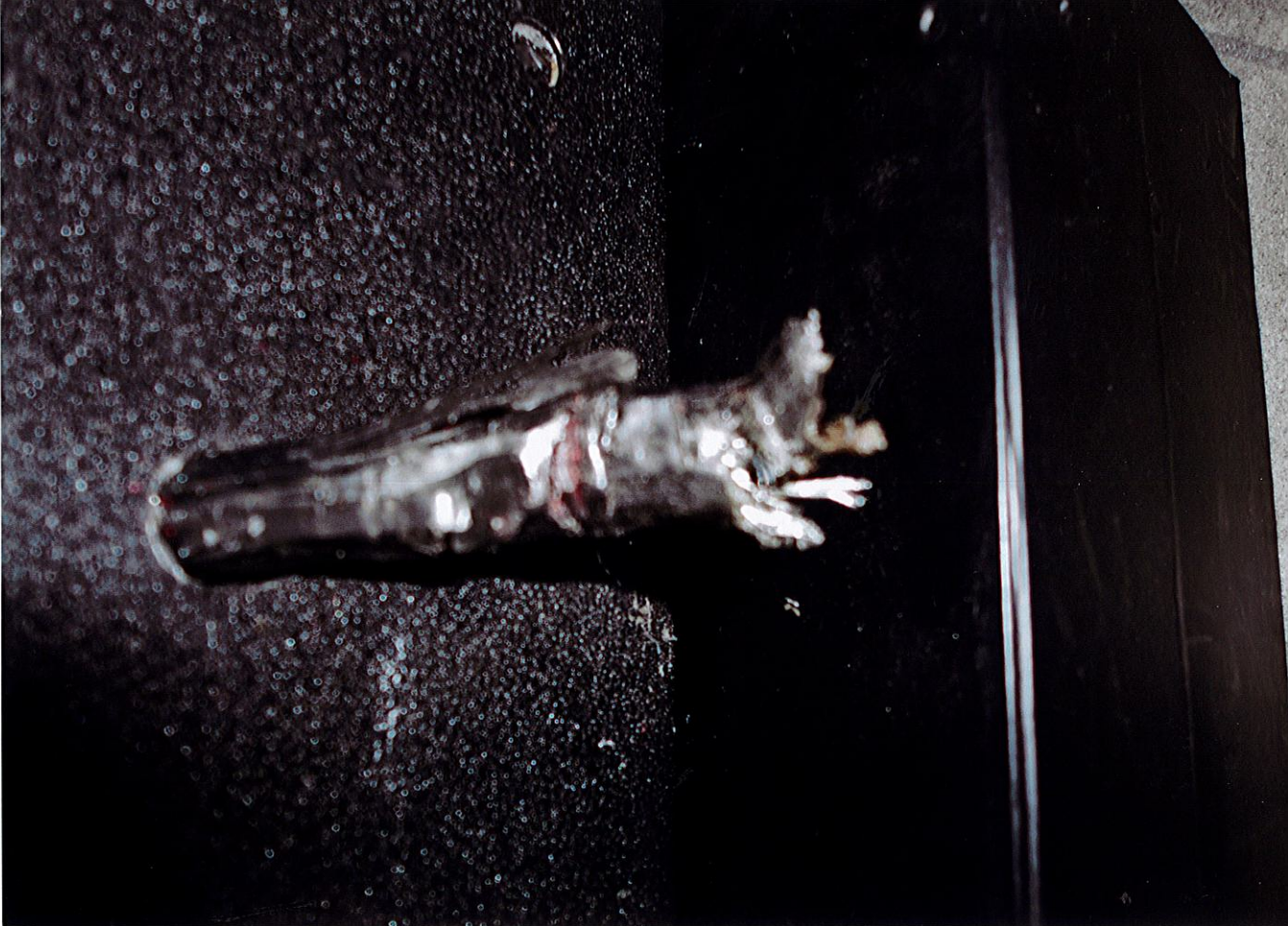
PHOTOGRAPH 16. GIPA 2019-566 - PAGE 28 CLOSE VIEW OF CUT BLACK SHEATHED CABLE.