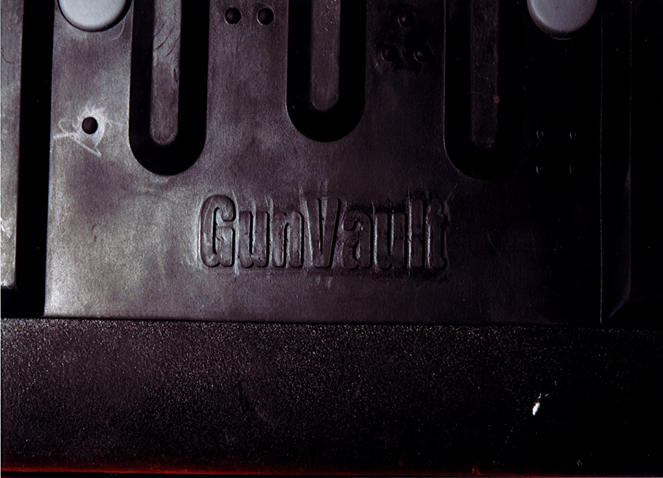
PHOTOGRAPH 13. VAULT’.

CLOSER VIEW OF SHOWING MANUFACTURED NAME ‘GUN