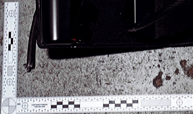
PHOTOGRAPH 17. VIEW OF OPENED GUNVAULT SAFE.