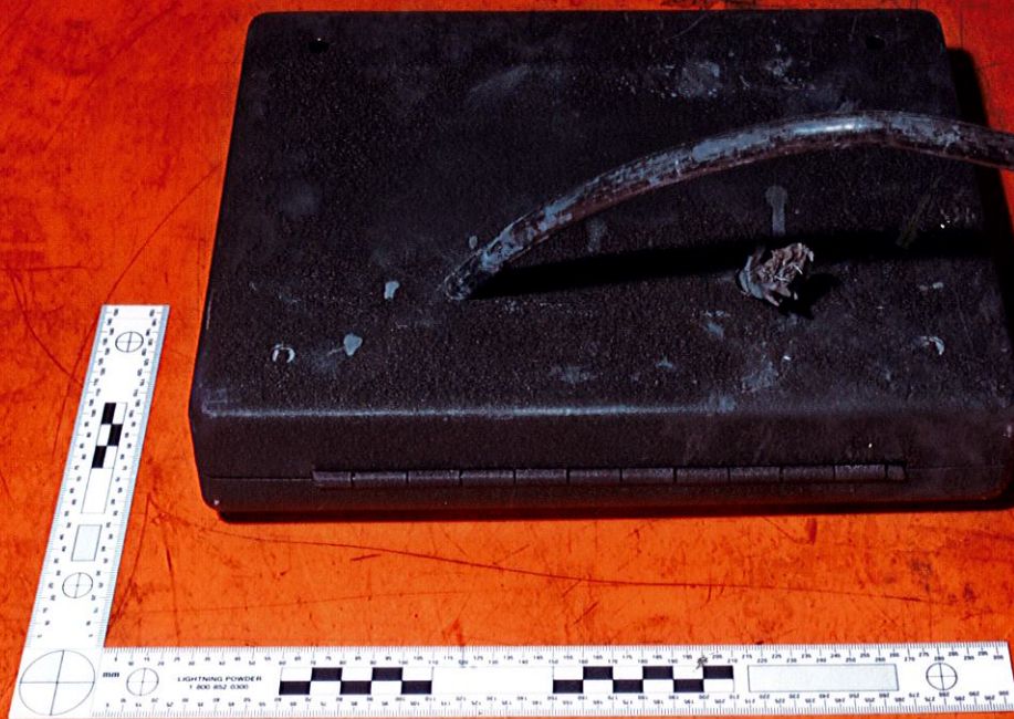
PHOTOGRAPH 11. VIEW OF TOP OF DEVICE REMOVED FROM MS PULVER.