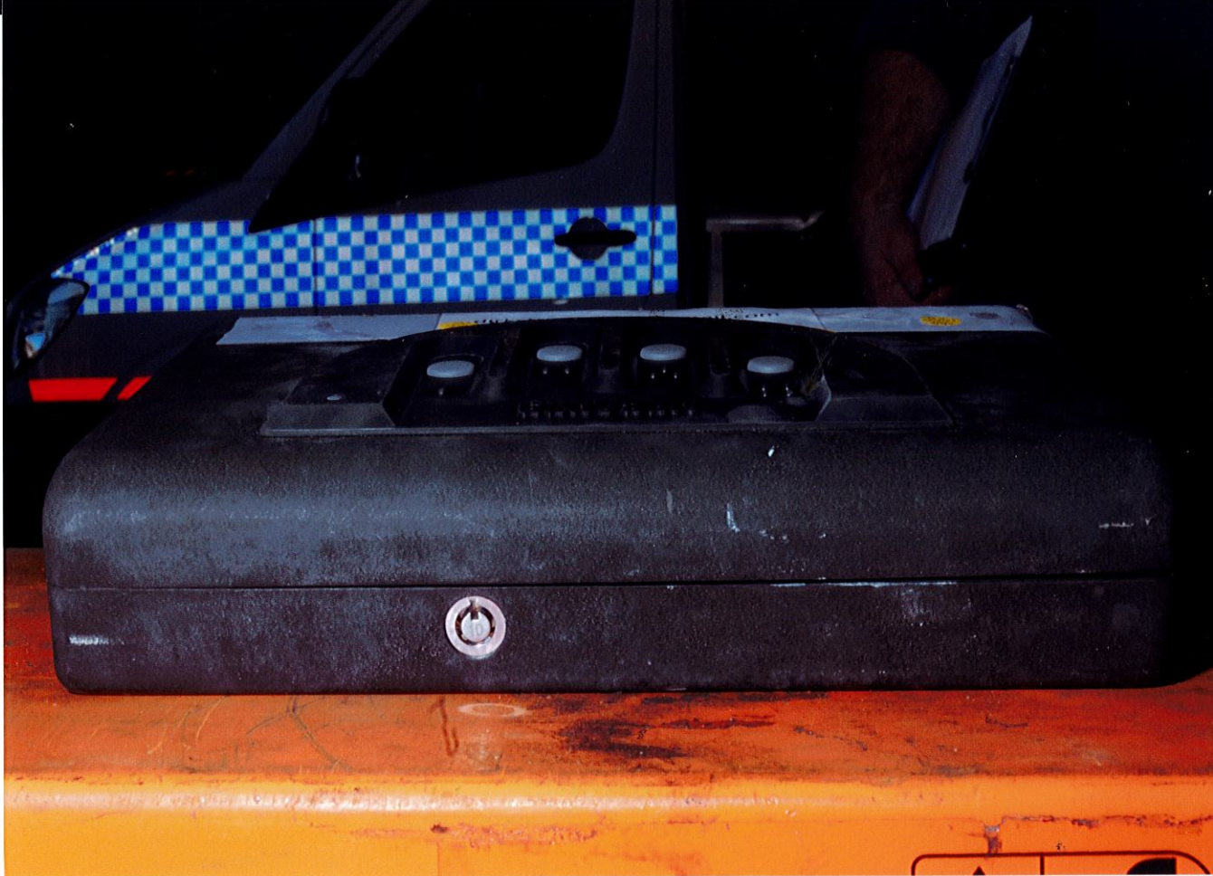
PHOTOGRAPH 14. GIPA 2019-566 - PAGE 26 FRONTAL VIEW SHOWING SECURITY LOCKING DEVICE.