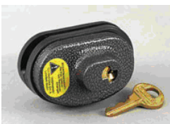
Examples of trigger locks