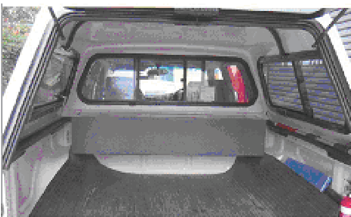
Safe bolted to structural parts of the vehicle

Leaving the firearms unattended overnight or for extended periods of time without added security or locking the vehicle in a secure compound would not be considered to be reasonable precautions to prevent loss or theft.