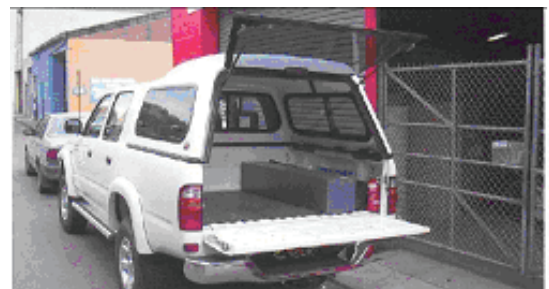
Doors must be locked while the vehicle is unattended and keys must not be left in the vehicle