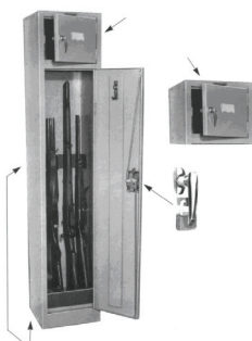
Example of cabinet with separate lockable ammunition storage container

Where a person has no firearms registered in their name, and is required to buy ammunition for business, employment or other purposes, they may make application for an Ammunition Permit under clause 69A of the Firearms Regulation 2006 . The applicant must hold a firearms licence and meet the other criteria for a permit of this type. See the FACT Sheet 'Ammunition Permit' on the Firearms Permit page on the Firearms Registry Internet site.